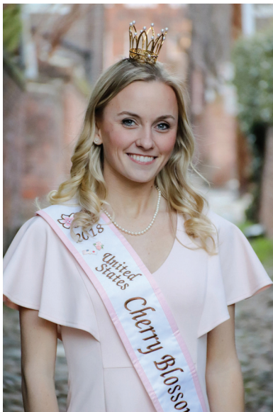
<---- 300 dpi high-resolution image

All fonts and photos should be embedded and all photos used in your ad should be at least 300 dpi at the size they are used in the ad. (See image examples below.) Do not use images obtained from the web, they are only 72 dpi and are not suitable for high-resolution printing.